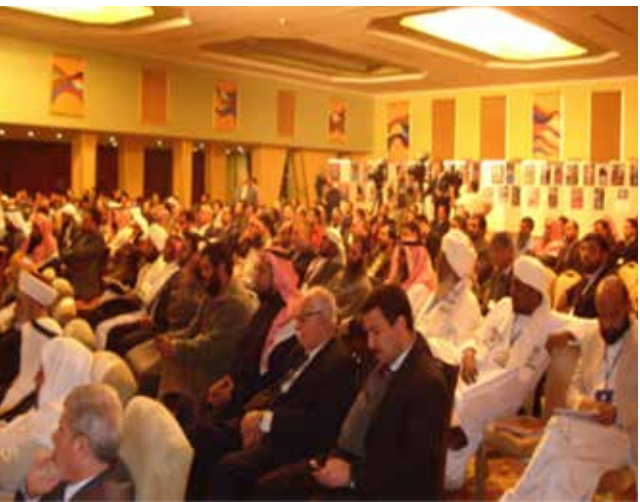
Panel speakers and audience at the 2006 "Iraqi Support" conference organized by GAAC in Istanbul.

was not prohibited by the Qur'an. By the 10th year of its operation, the GRF had raised $20 million, and became the second-largest US Islamic charity behind the Texas-based Holy Land Foundation. Local media reported that GRF had about 20,000 donors in the United States and Europe; 15 full-time employees at its Chicago office; and employed about 150 nurses, doctors, teachers, program directors and others on four continents on a part-time basis - according to court records and statements by GRF officials. 174