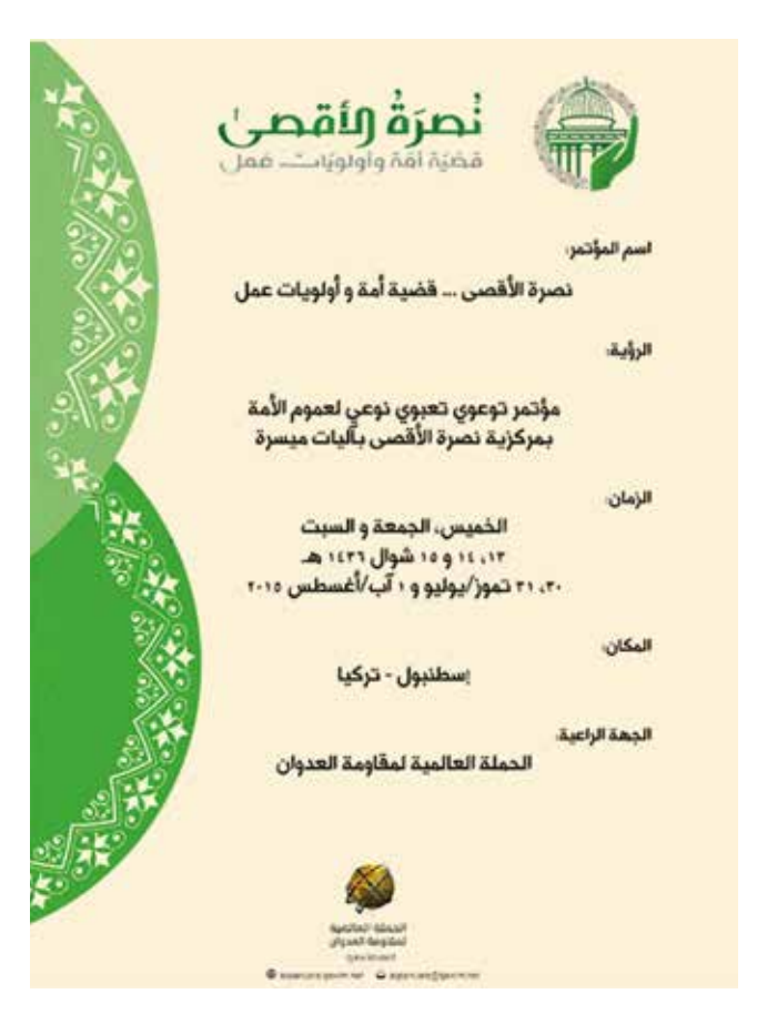
Announcement of the 2015 GAAC conference published on agsanusra.qawim.net

a group describing itself as "a global independent body grouping Islamist parliamentarians of all countries for coordination, consultation and cooperation." <sup>283</sup> Partner organizations included: