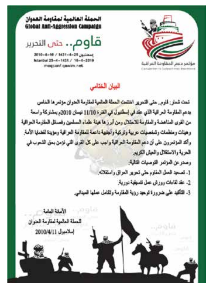
Closing statement of the "Iraqi Resistance Support Conference" in Istanbul, 2010. Referring to Istanbul as "Islambul".

official Danish position from that of Jyllands-Posten and to take measures of appeasement expressing goodwill; (b) to establish legislation that protects the rights of Muslims and the image of Islam; (c) to recognize Islam as a component of the religious landscape in Denmark and work for it to be seen in practice on the same footing as other religions; (d) to establish an observatory funded by official authorities to monitor the realization of respect for Muslims and their religion in the political, economic, cultural, and educational fields; (e) to organize an international conference on dialogue among civilizations in Copenhagen or in another European country, chosen by common agreement; (f) to withdraw Danish soldiers from Iraq and Afghanistan.